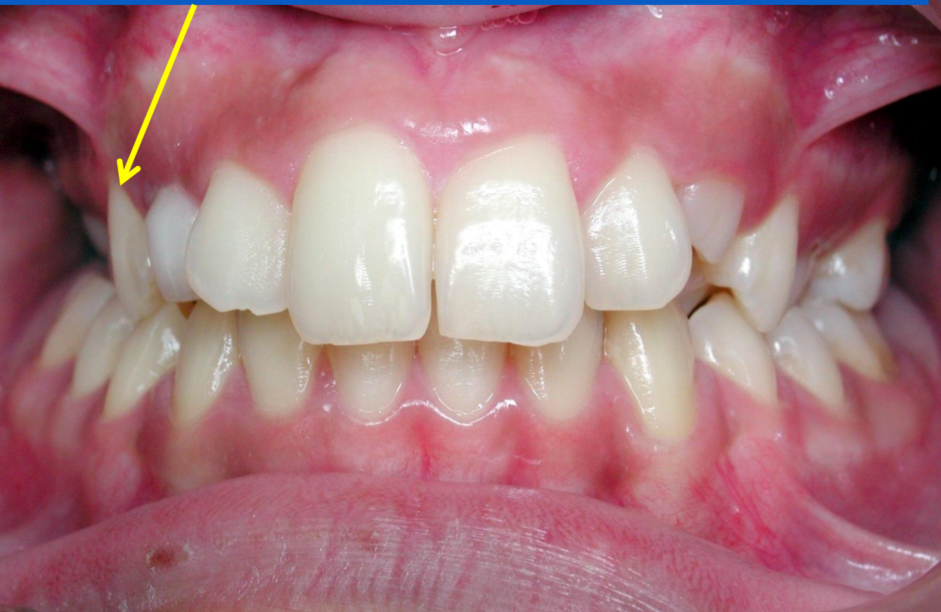
ENDOGNATHIE: ARTICULE INVERSE