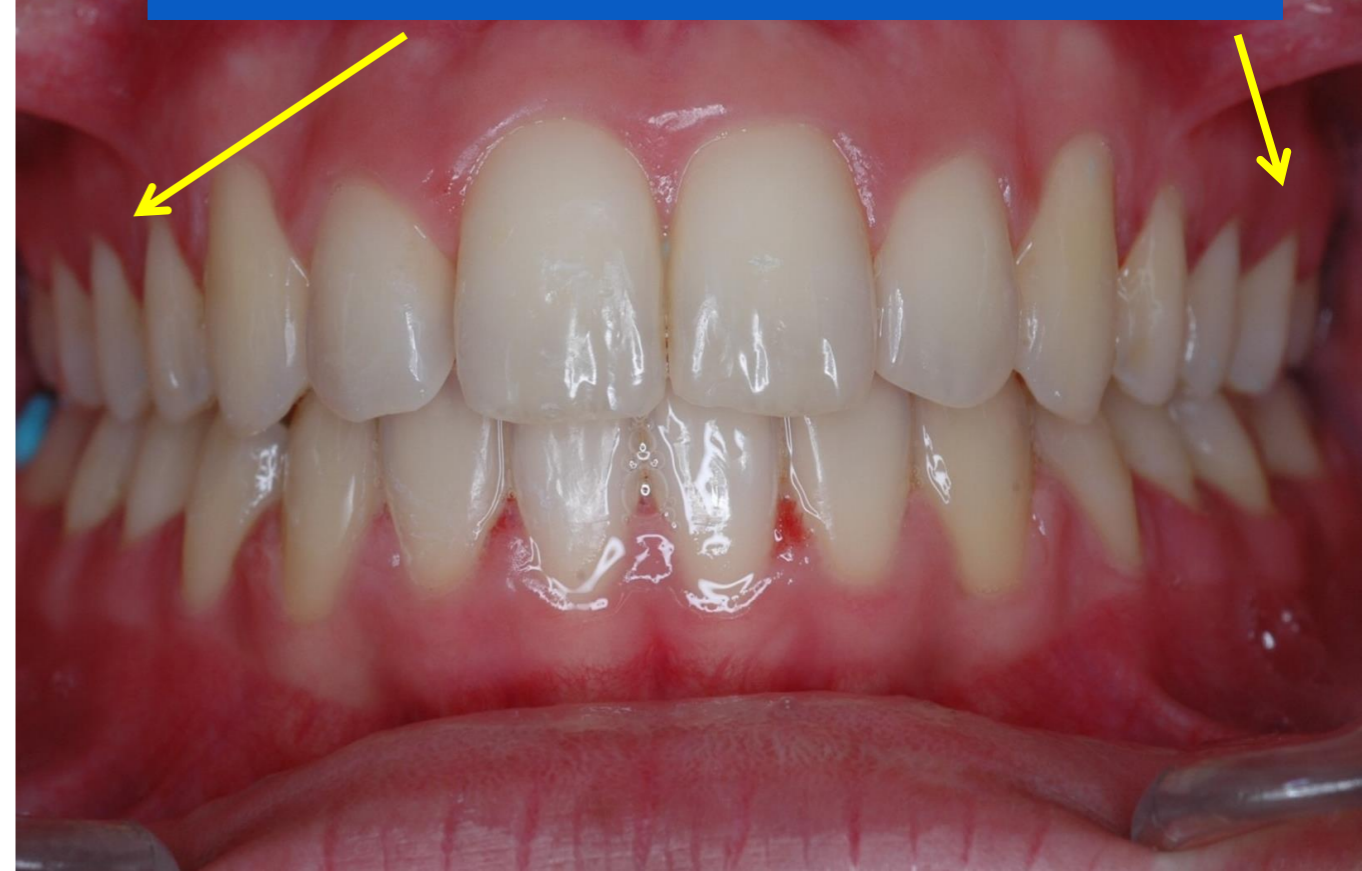
INVERSION LATERALE CORRIGEE